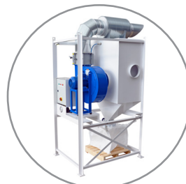
MOBILE DUST EXTRACTION UNITS