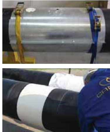
CSC-X Molded Foam