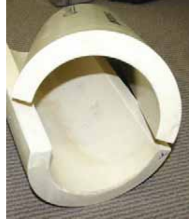
CSC-X Foam Half-Shells