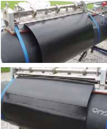
CSC-X Field Bonder